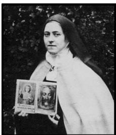
St. Therese of the Child Jesus and the Holy Face

"Make Your face shine upon Your servant, And teach me Your statutes." Psalm 119:145