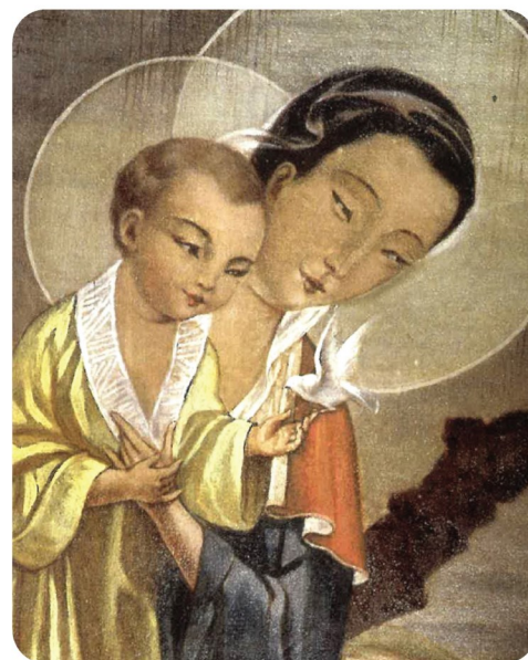
VIRGIN AND CHILD, ASIA (ARTIST UNKNOWN)

Recall, too, that Jesus and his disciples spoke Aramaic, and there is no equivalent for the meaning of "cousins" as we know it in that language. Instead, the word for brother or sister was used when referring to cousins. Thus, when St. Jerome ( circa 340–420) translated the Bible from Hebrew into Church Latin, he considered "the brothers of Jesus" as cousins, not siblings. After all, it would have been the rightful responsibility of these male relatives of Jesus to take care of Mary when Jesus died. Yet Jesus entrusts his mother to the care of his beloved disciple John (John 19:26). ●